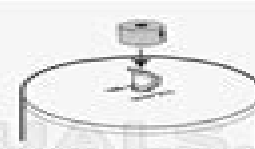
Typical Top Connect T & P Arrangement.

Slip the insulation cover over the T&P Valve through the center hole and align the hole in the side with the opening of the