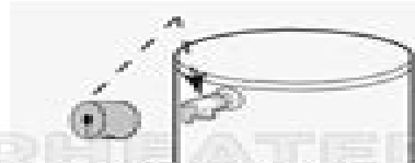
Typical Side Connect T & P Arrangement.

For increased energy efficiency, this water heater has been supplied with a 2 3/8" section of T&P insulation. Please install the insulation as shown below.