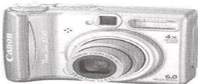
Photo of PowerShot A540