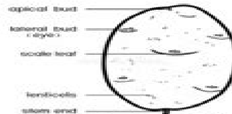
Diagram of specimen C/Irish potato