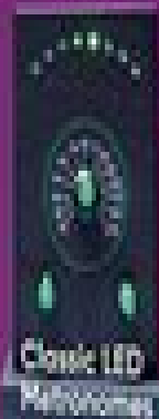
Classic LED Meteronomes

Make it with Microcontroller Multiple channel for a Project