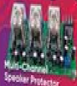
Multi-Channel Speaker Protector