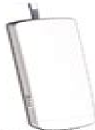
Figure 1 S541.RF/RT3

The RT3 (S541.RFT), a modified S541.RF, comes equipped with a temperature sensor and dispenses with the wiring harness for use as a low-cost remote battery operated temperature measurement device only.