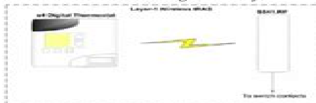
Figure 2 Network Topology