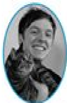
Sam is the author's cat's cat. He enjoys long walks, beam jacks and shitting in the bath.

Rude Vile Pigs is a satirical black comedy set in the city of Sadukitepeopledrinking, and follows the antics of Jim Joy, a middle-aged alcoholic who accidentally creates a religion dedicated to selfishness.