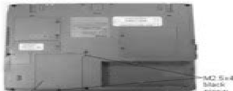
HDD slot cover