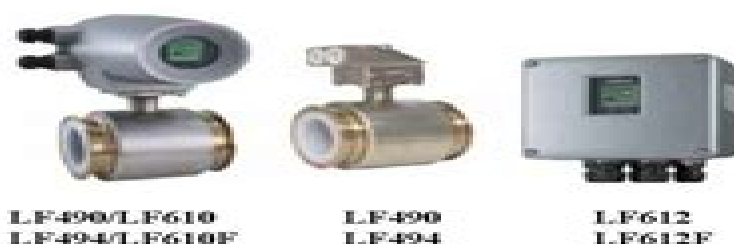
Figure2. LF490 series flowmeters