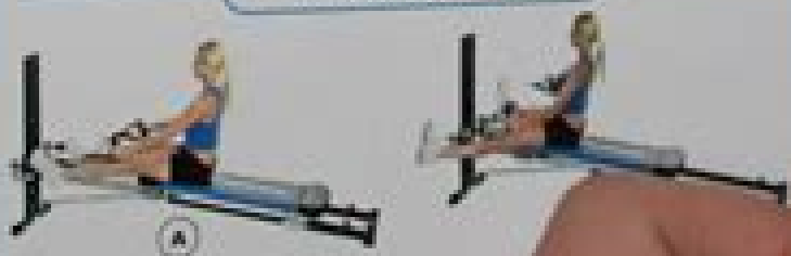
7. Outer Hip & Thigh