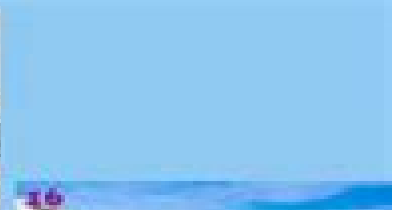
Tenorio: the prettiest seaside village on the Costa Brava