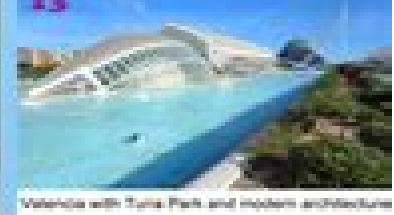
Valencia with Turia Park and modern architecture