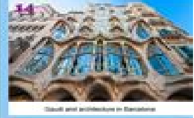
Gaudi and architecture in Barcelona