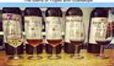
Visit the vineyards of Jerez de la Frontera