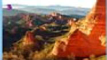
Visit in Las Medinas Roman gold mines