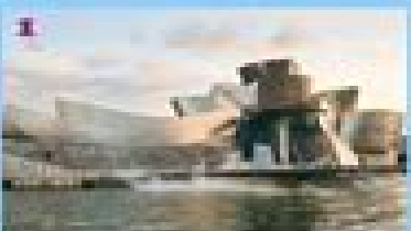
Bilbao: Visit the Guggenheim Museum B and parks