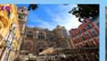
Take a route tour of Valencia