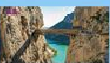
Hiking Camino del Rey and El Torcal