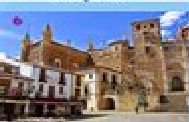
The towers of Trujillo and Cuatrecasas