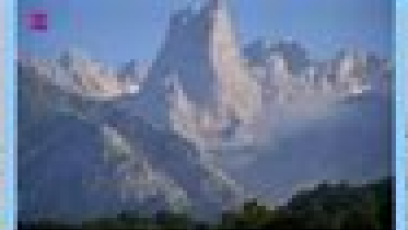
Hiking in Pico de Europa National Park