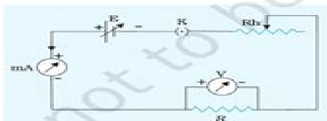
Fig. E 1.2 Circuit to find the relation between current I and potential difference, V for a given wire