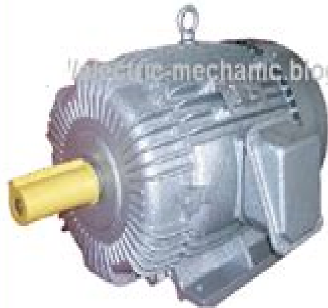
INDUCTION MOTOR 3 PHASE 380 V/15 KW