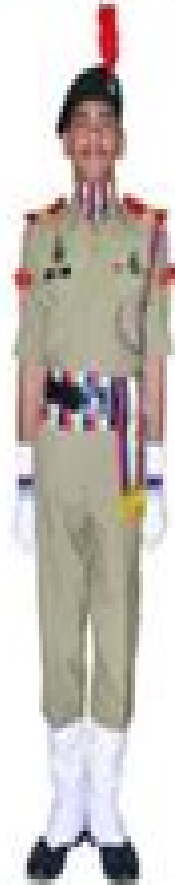
Ceremonial Dress of NCC Cadet