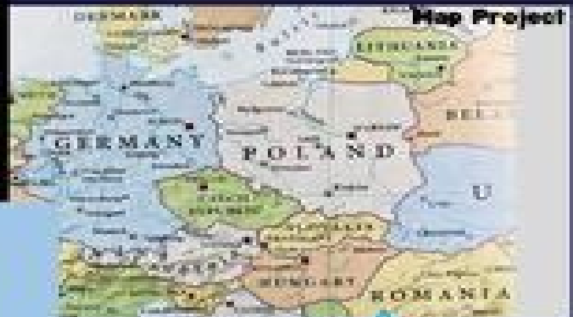
Poster/Timeline Example Map Example (From "The Most Dangerous Game")