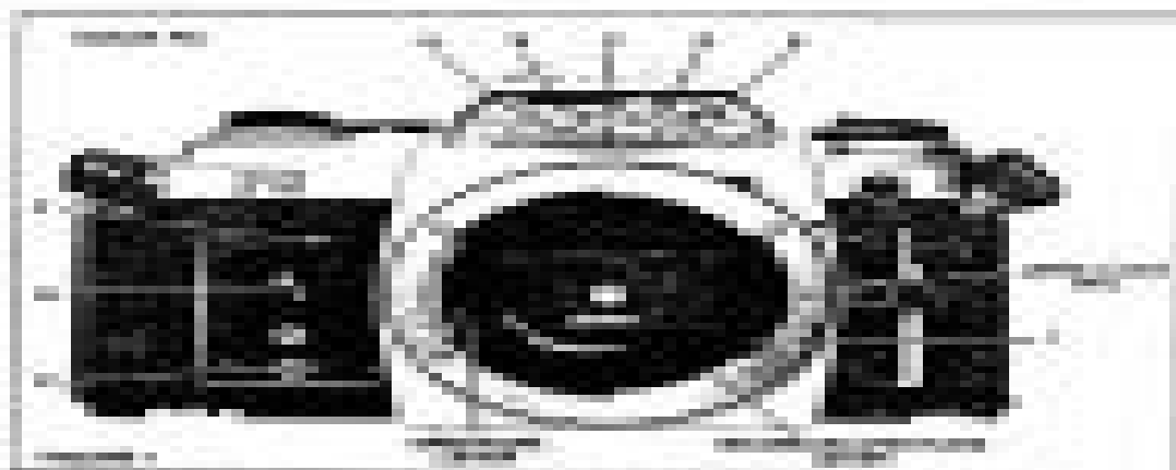
Fig. 21—Independent and independently adjustable

Fig. 20—Independent and independently adjustable