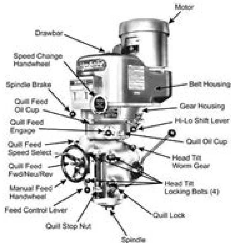
Bridgeport Series 1 1/2" Head