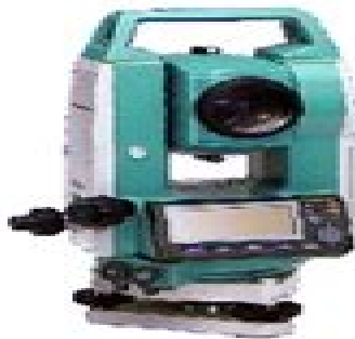
Gbr1. Tampilan SOKKIA Set 510