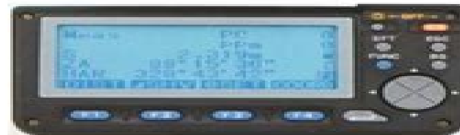
Gbr2. Tampilan Display SOKKIA Set 510