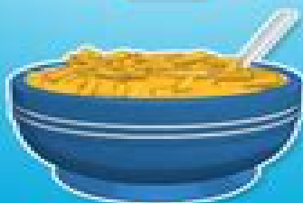
Macaroni & Cheese