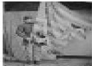
Soldier with Union Flag

The debate over slavery and rights was a main factor leading to the bloodiest war in our country's history. The slave states in the South decided they would be better off as a separate nation, so they seceded from the United States. Secession means separation or breaking away. But President Abraham Lincoln did not want the nation to be divided. War began between the southern states, which called themselves the Confederate States of America, and the northern states, which were still known as the United States of America. President Lincoln led the United States during the war. The Confederate States set up its own government and military. This "War Between the States," now called the Civil War, deeply and bitterly divided Americans on both sides.