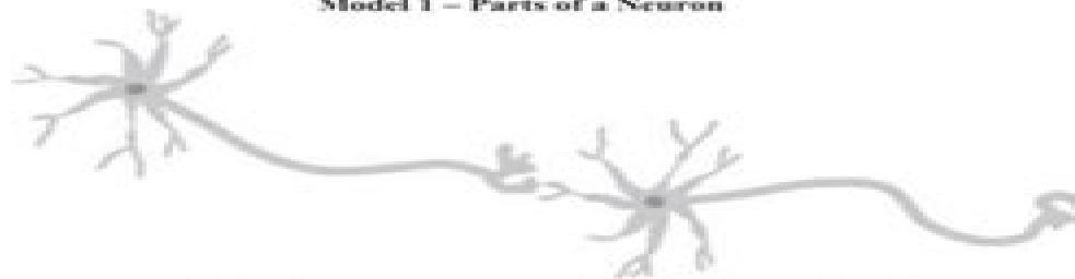
Model 1 – Parts of a Neuron

Cells are specialized for different functions in multicellular organisms. In animals, one unique kind of cell helps organisms survive by collecting information and sending messages throughout the body. The shapes and features of neurons, which are the primary cells in the nervous system, enable animals to experience all of the five senses; find food, mates, and shelter; and to survive in their diverse environments.