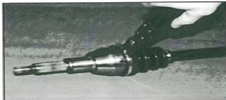
CV Boot Clamp Pliers: Earless Type (PN 8700226)