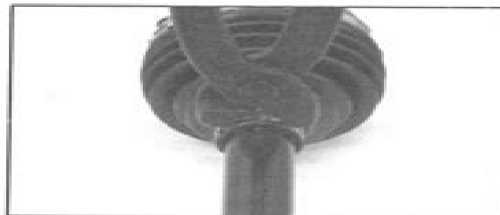
Axle Boot Clamp Tool PU-48951 or 8700226