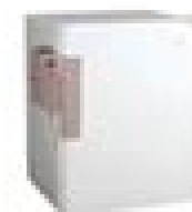
Pyxis® SMART Remote Manager (refrigerator not included)