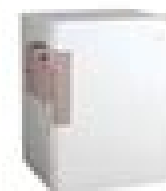
Pyxis® SMART Remote Manager (refrigerator not included)