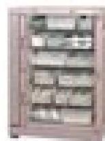
Pyxis MedStation® 3500 half-height column auxiliary (2 doors) 30"W x 28"D x 48"H