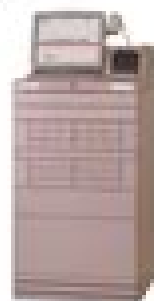
Pyxis MedStation® 3500 4-drawer main* plus bin 22.8"W x 27"D x 50"H