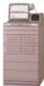
Pyxis MedStation® 3500 6-drawer main* 22.8"W x 27"D x 50"H