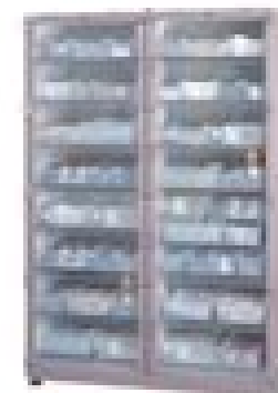
Pyxis MedStation® 3500 double column auxiliary (8 doors) 52"W x 28"D x 76.5"H