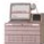
Pyxis MedStation® 3500 2-drawer main* 22.8"W x 27"D x 27.8"H