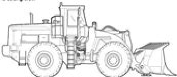
Figure 1 Wheel loader 1200

1200 is a two-wheel drive articulated wheel loader.