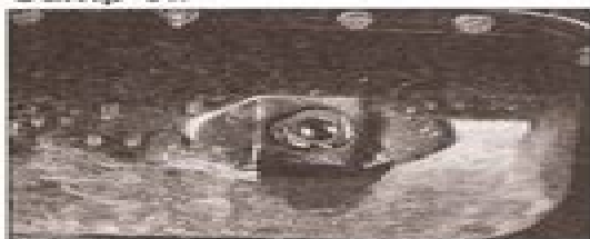
Engine oil may leak from the drain plug....