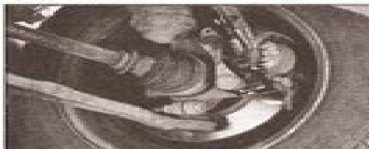
A leak occurring at a wheel is almost certainly brake fluid.