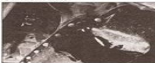
...or from the base of the oil filter.