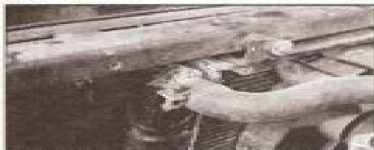
Leaking antifreeze often leaves a crystalline deposit like this.