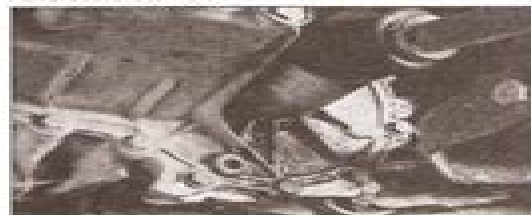
Gearbox oil can leak from the seals at the inboard ends of the driveshafts.