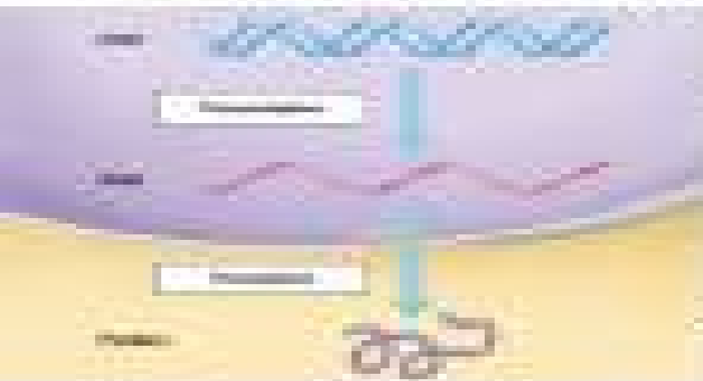
Figure 1-1 (in figure) shows the flow of information from DNA to RNA to protein. The flow of information from DNA to RNA is called transcription. The flow of information from RNA to protein is called translation.

Activity 2: The flow of information in DNA & RNA & PROTEIN