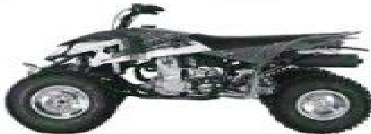
OUTLAW 525 S