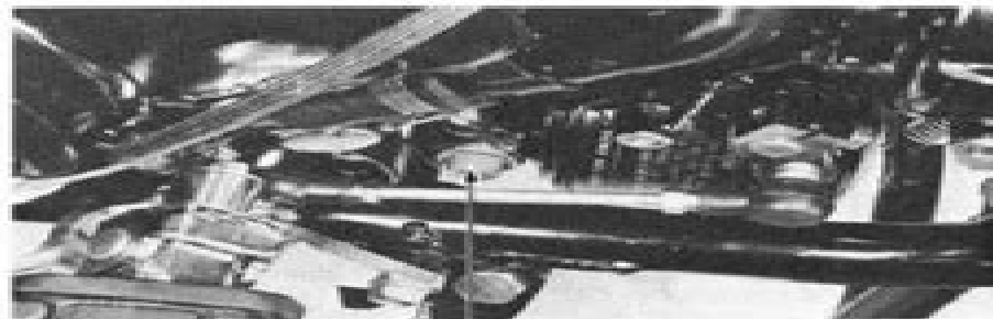
(1) OIL PRESSURE SWITCH (1) OIL PRESSURE GAUGE 07506-3000000 OIL PRESSURE GAUGE ATTACHMENT 07510-3000100

Remove the oil pump by removing the mounting bolts.