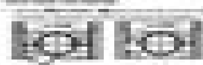
Figure 3. Map of the study area showing the location of the study area in the coastal zone of the city of Valencia, Spain.