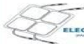
ELECTRODES (PACKAGE OF 4)