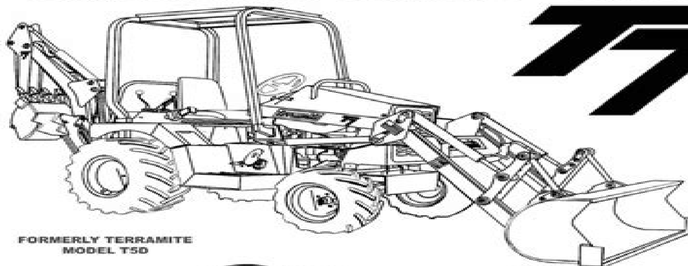
FORMERLY TERRAMITE MODEL T50