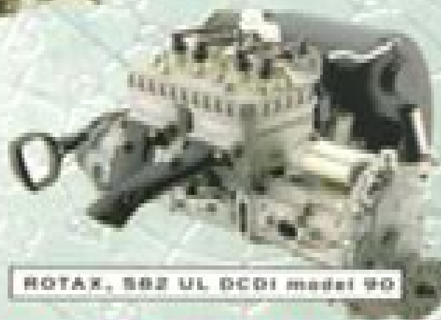
ROTAX, 582 UL DCDI model 90