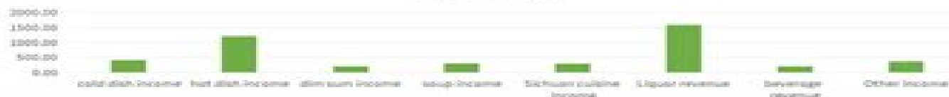
Single day data weekly data