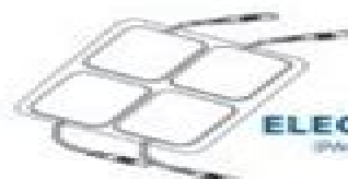
ELECTRODES (PACKAGE OF 4)