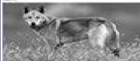
Opinion — Kangaroos or Cattle?

By [Name] [Address] [City] [State] [Postcode]