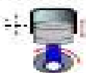
Figure 1: A cylinder with a sinusoidal wave projected onto its side.