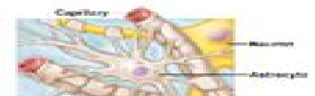
(a) Astrocytes are the most abundant CNS neuroglia.