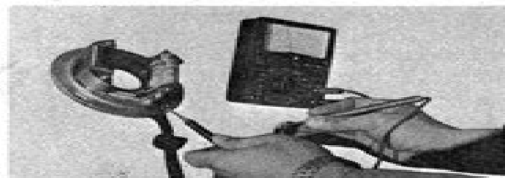
Fig. 8-5-2 Measure the resistance of pulser coil