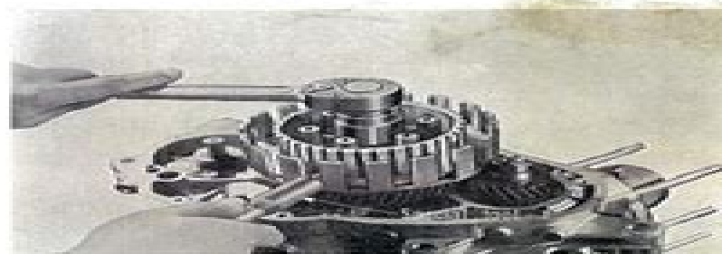
Fig. 6-6-1 Loosening clutch sleeve hubnut