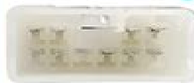
10Pin Power Adapter