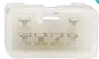
6Pin Speaker Adapter