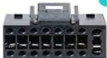
16Pin ISO Adapter