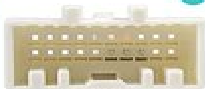
20Pin SWC Adapter (no canbus)