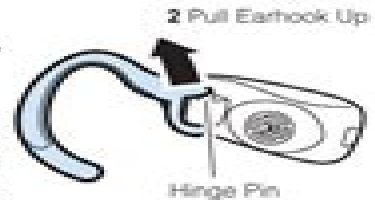
2 Pull Earhook Up