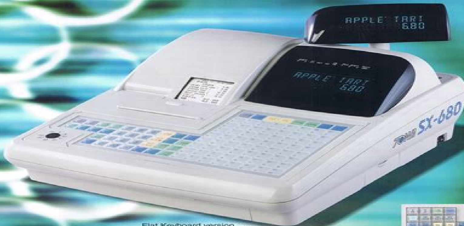
Flat Keyboard version (shown without Cash Drawer)