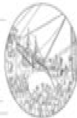
The Battle of the Clouds