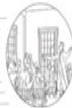
The First Continental Congress