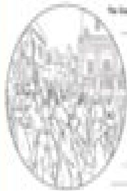
The Boston Tea