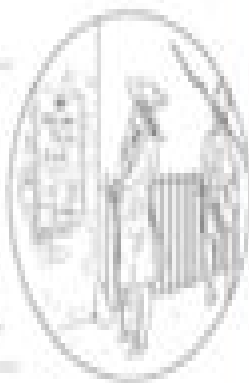
The Declaration of