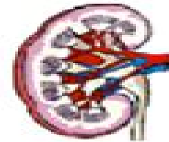
The Kidney - cut away view