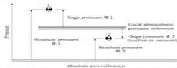
Figure 3.2 Fundamentals of Fluid Mechanics, 6th ed. by Bruce Munson, Donald Young, and Theodore H. Koehn © 2006 by McGraw-Hill Education. All rights reserved.