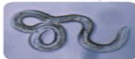
Vinegar eel (2 mm in length)