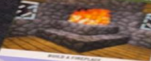
BUILD A FIREPLACE