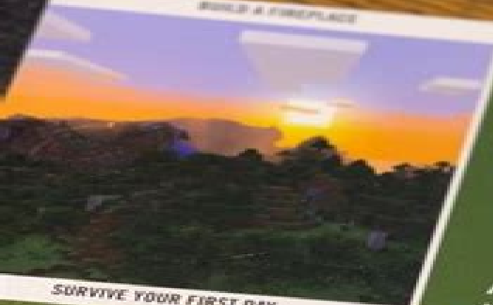
SURVIVE YOUR FIRST DAY