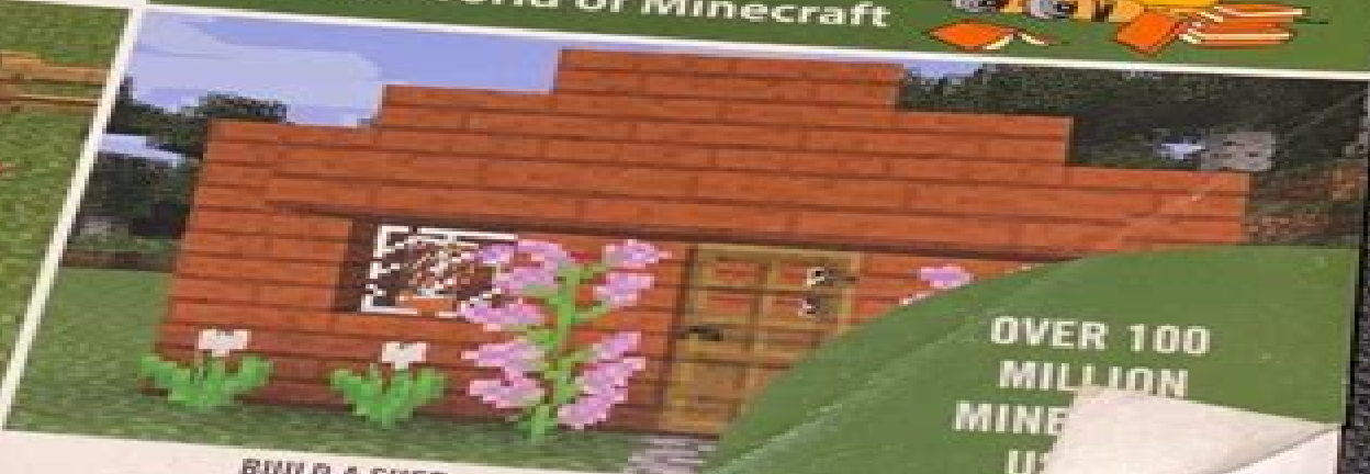
BUILD A SHED