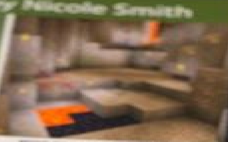
MINE FOR PRECIOUS METALS