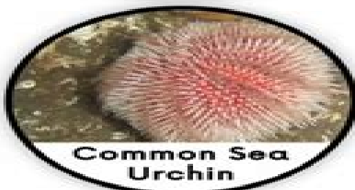
Common Sea Urchin