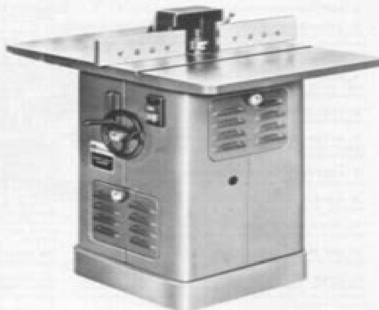
Shown With Accessory 43-240 Table Extension, Cutterhead and Drivehead

The Serial No./Model No. plate is attached to the back side of the cabinet. Remove this plate and insert the Serial No. and Model No. in your manual for future reference.